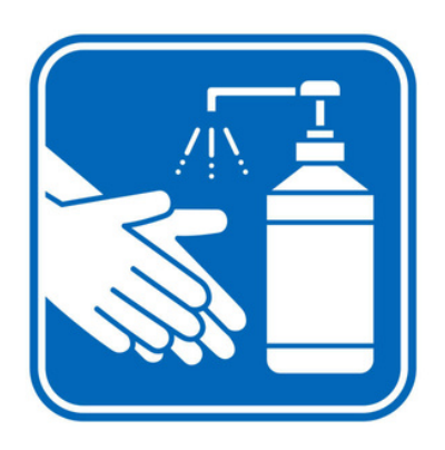
Wash Hands frequently and Sanitize