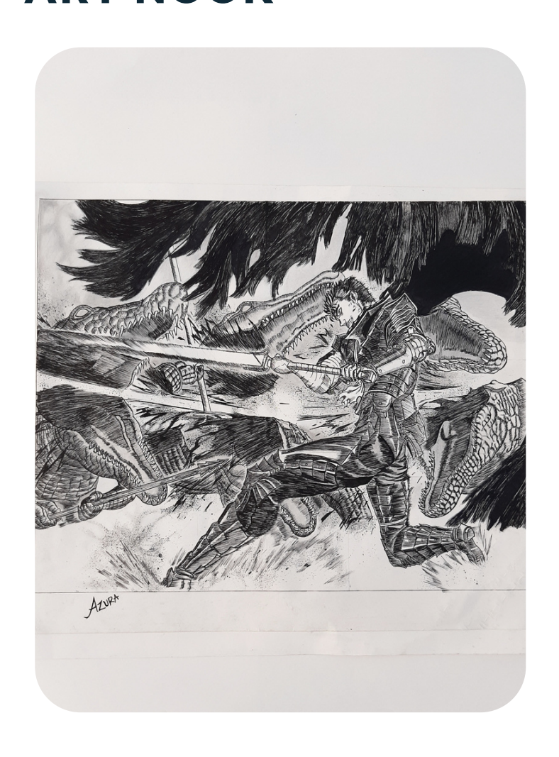
ANIKET VERMA 8BTEE