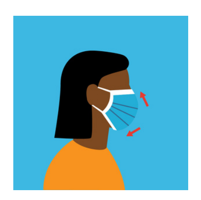
Always wear a face-cover/Mask